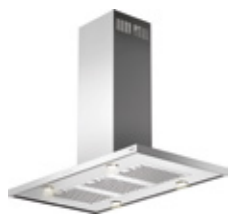
Stainless steel FQHI 900 X Code EAN 8019801015740