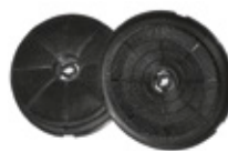
Set of 2 charcoal filters KITCF009 Code EAN 8019801015863