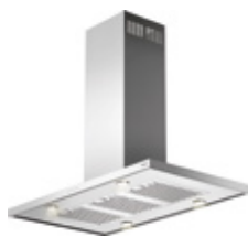
Stainless steel FQHI 1200 X Code EAN 8019801015757