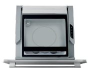
STAINLESS STEEL FVSD 2900 TC EAN 8019801019496

The vacuum sealing drawer's structure is made with panels. A stainless steel panel kit with a handle (code FT 29 X) is available on request.